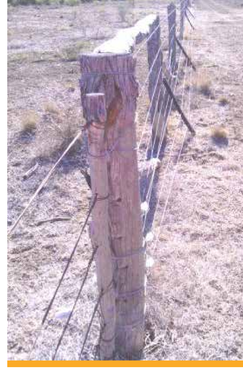
Figure 2: The electrified boundary fence with 3-wire off-sets, positioned 45 degrees to the fence to reduce invasion of wild dogs.

Shooting is still an important control measure, so a firearm is carried in the event of sighting a wild dog while out motorbike baiting.