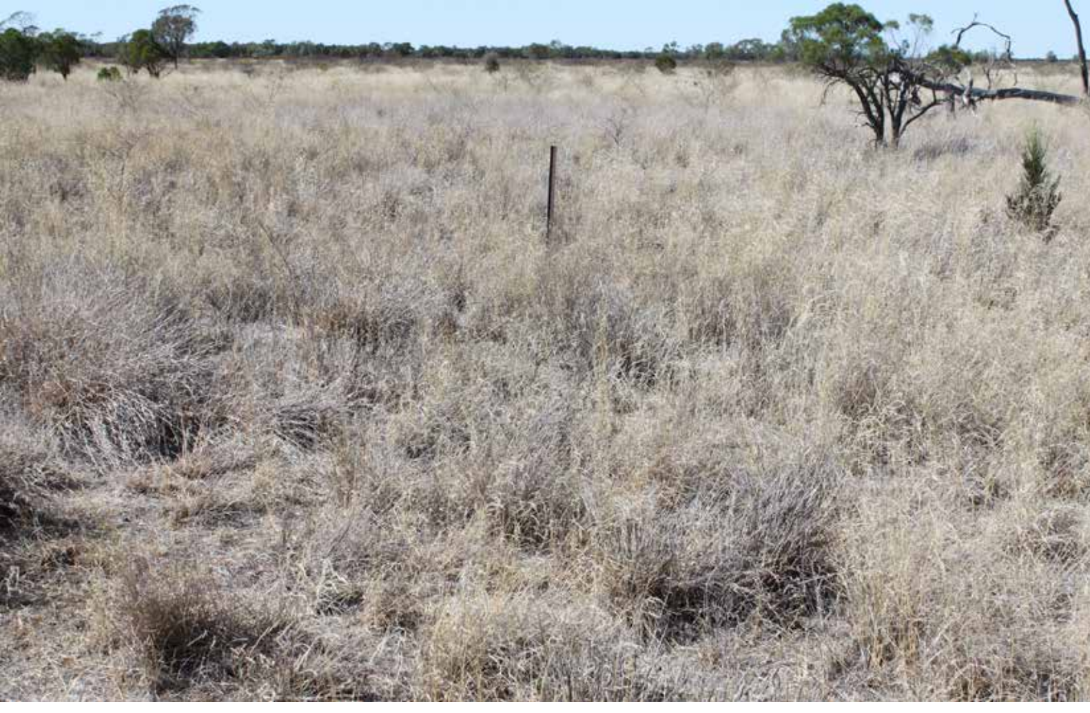
Figure 4: Mitchell Grass Downs country on Dunblane.