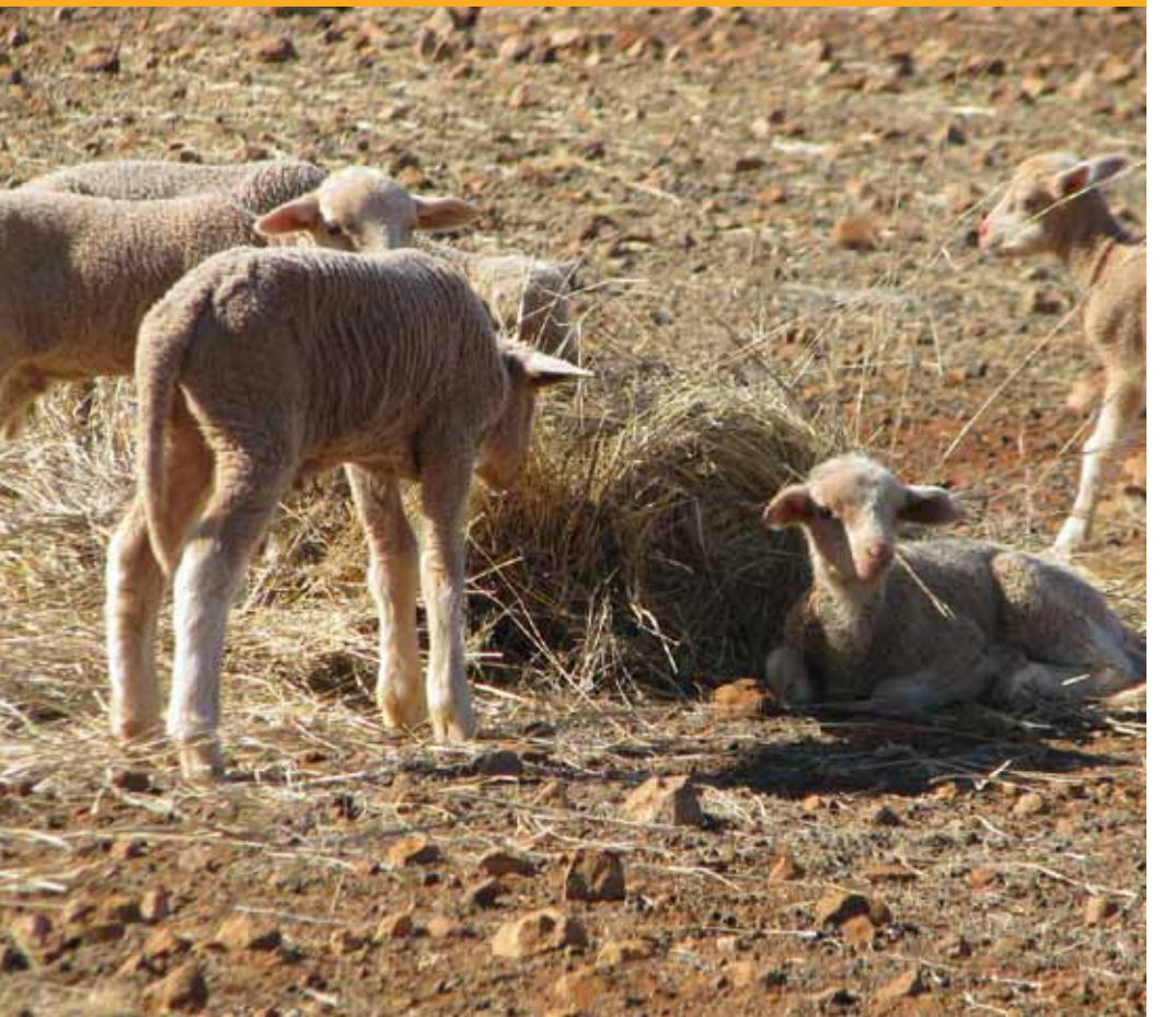
Figure 2: Lambs at Colanya Station.

In good seasons the Hegarty's also mow tracks through the long grass to avoid lambs being mis-mothered when travelling to and from watering points.