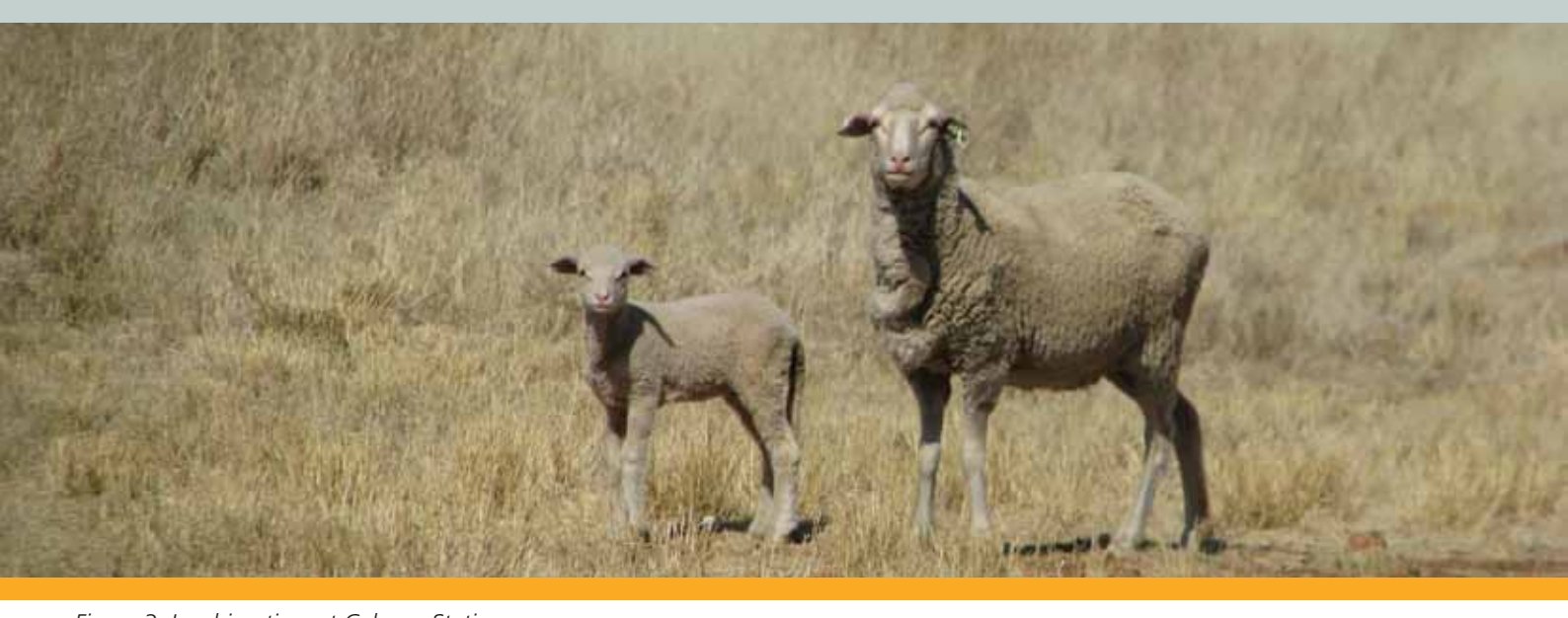
Figure 3: Lambing time at Colanya Station.

To view more innovation profiles, business cases and videos of innovations in the pastoral zone, visit the Bestprac website <a href="https://www.bestprac.info">www.bestprac.info</a>