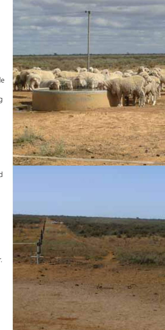
Figure 4: Landscape at Wyndham Station.

Figure 5: Angus White and Nic Kentish from Land and Livestock discuss the processes of low stress stock handling.